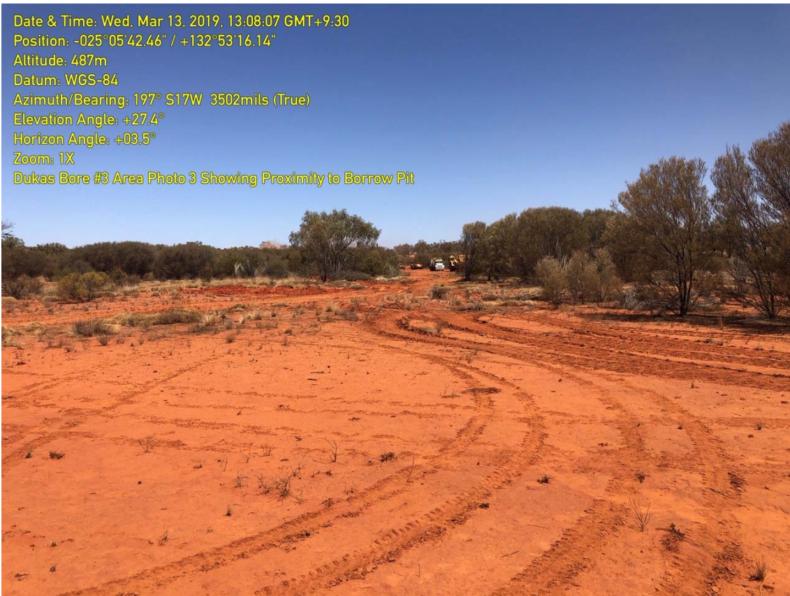
Figure 2: Photos of the proposed third water bore location

Date & Time: Wed, Mar 13, 2019, 13:08:07 GMT+9:30 Position: -025°05'42.46" / +132°53'16.14" Altitude: 487m Datum: WGS-84 Azimuth/Bearing: 197° S17W 3502mils (True) Elevation Angle: +27.4° Horizon Angle: +03.5° Zoom: 1X Dukas Bore #3 Area Photo 3 Showing Proximity to Borrow Pit