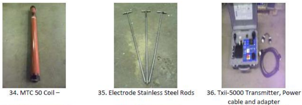
Figure 2- Acquisition technology for the ORION 3D DCIP Survey, Glyde Sub-basin, McArthur Basin; EP171 & EP190.

The objective of the work program is to assist in providing some definition of potential hydrocarbon bearing gas reservoirs and future drilling locations that will target the Coxco-Teena Dolomite.