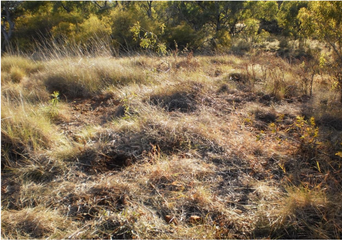
Figure 4- Example DCIP location site after data acquisition.