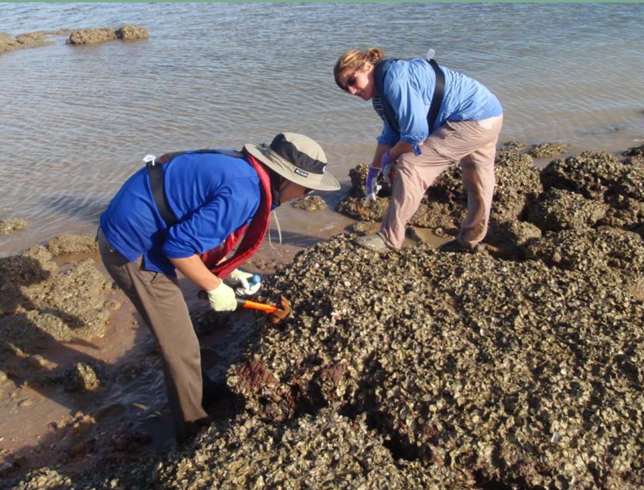
Sampling oysters ( Saccostrea cucullata ) for assessing micropollutant levels at a reef in West Arm. This area is commonly considered to be a "reference" area with minimal human impacts.