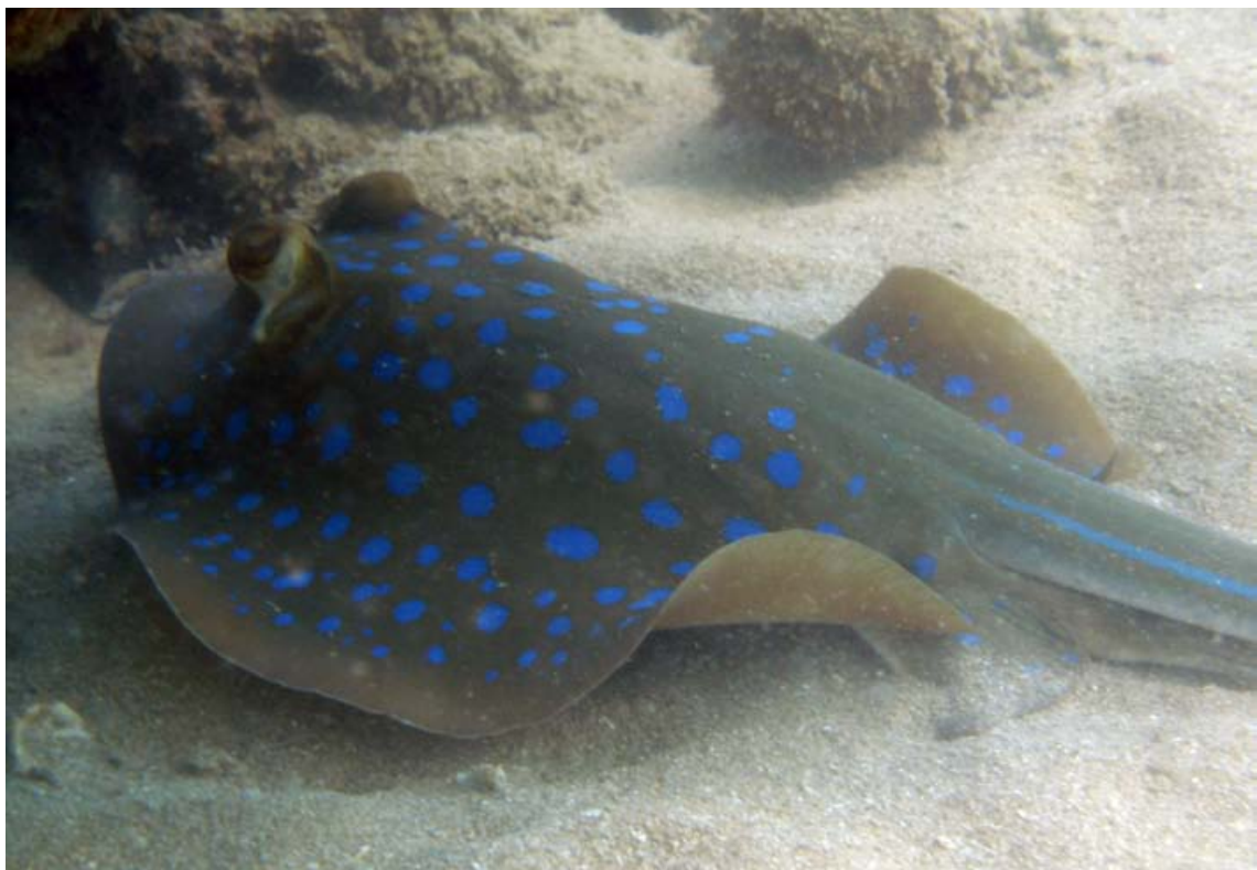
The blue-spotted fantail ray ( Taeniura lymma ) is a predator of molluscs on rocky reefs.