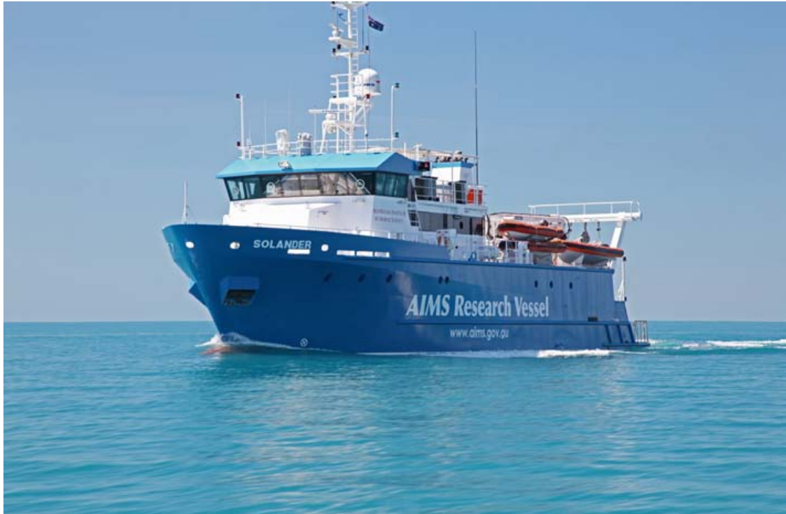
The Australian Institute of Marine Science research vessel "Solander" has been used in a collaborative project to assess micropollutant levels in molluscs in impacted areas of Darwin Harbour and unimpacted areas such as West Arm.