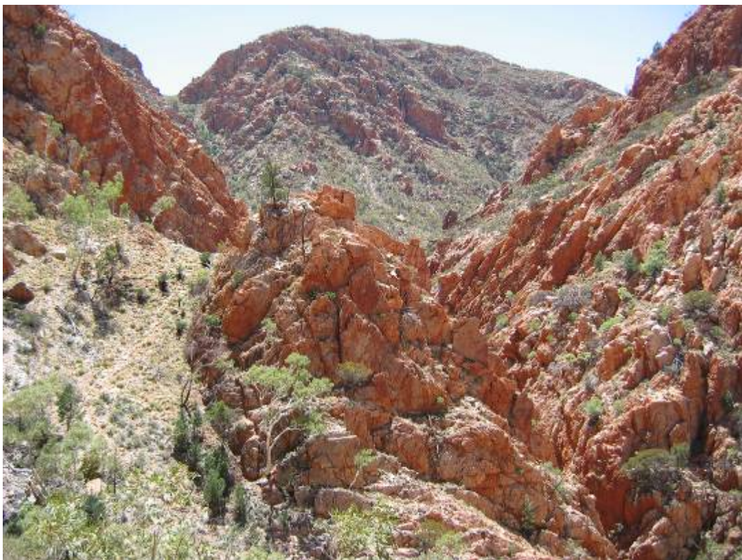
Figure 2: Steep gorges in the Chewings Range inhabited by the Desert Sand-skipper.

Extant populations of the Desert Sand-skipper are typically found on the steep slopes of gorges and along creek lines of the Chewings Range (Figures 2 and 3). The present range of this species is characterised by sheltered habitats with protection from naturally occurring fires and extremes in temperature. All sites are well vegetated, with a large variety of native trees, shrubs and herbs. The steep topography of the Chewings Range has reduced the incursion of introduced weeds, although these are sometimes seen. Although all sites are critical to the survival of this species, the Chewings Range localities are the ones most likely to provide suitable habitat in the long term.