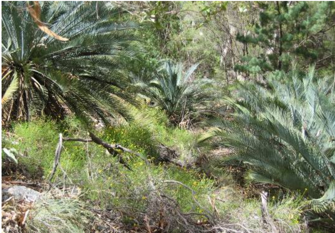
Figure 3: Example of a sheltered, well vegetated creek line in the Chewings Range inhabited by the Desert Sand-skipper.

between 0.6 and 1.5°C (CSIRO 2007). The best estimate projections for 2050 and 2070 are for even drier and hotter conditions (CSIRO 2007).