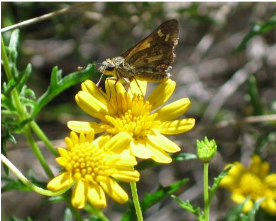
Female desert sand-skipper.