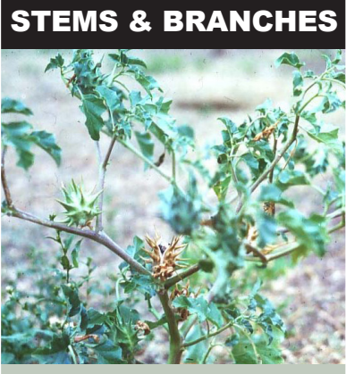
An erect annual plant that grows to 1.5m.