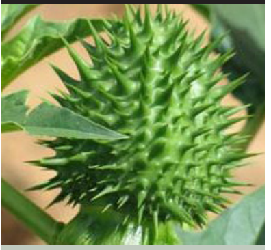
Easily distinguished by round, spiny fruit. Fruit are filled with numerous black kidney shaped seeds.

Weed Management Officers from the Weed Management Branch can provide advice on all aspects of weed management including control techniques, biological control, legislative responsibilities, policy advice, monitoring and regional planning. For further information on weed management planning, integrated control, herbicide application techniques and monitoring please refer to the <u>NT Weed Management Handbook</u>.