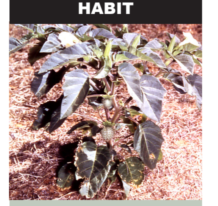
Prefers disturbed sites and fertile soils. Spead by vehicles, pasture seeds and grain.

Thornapple is a declared weed in accordance with the Weed Management Act.