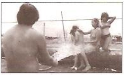
Taking a shower from the water main, Stuart Highway