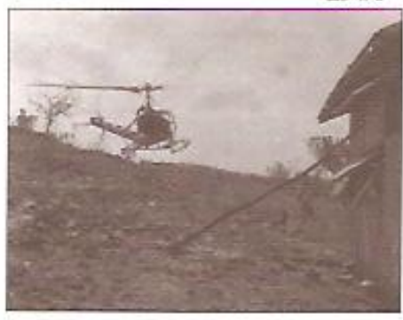
Helicopters used in hut construction at Katherine Gorge 1958