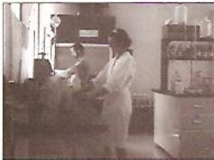
The Laboratory at Bishop Street