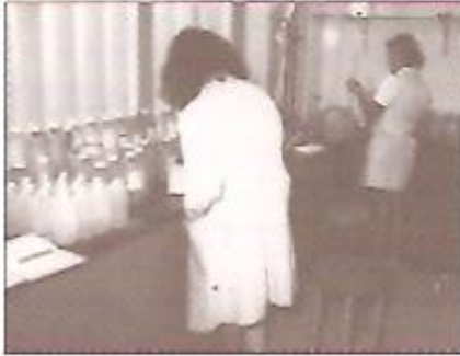
Inside the Water Quality laboratory

Alice Springs was running out of water (G Ride)