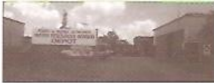
Tunnadice Street Depot, Winnellie

The NT Government approved construction of a flood mitigation dam at Junction Waterhole, 9km north of Alice Springs on 27 November 1990. Construction work at the dam site began in January 1991. On 26 March 1991, the Federal Minister for Aboriginal Affairs, the Hon. Robert Tickner MP, issued a stop work order at the request of the Central Land Council, and the construction authority certificate for the dam was withdrawn by the Aboriginal Areas Protection Authority. On 15 May 1992, based on the advice contained in a report produced by Mr John Halden Wooten AC QC, the Federal Minister issued a declaration prohibiting all work on the site except rehabilitation and pastoral activities for a period of twenty years.