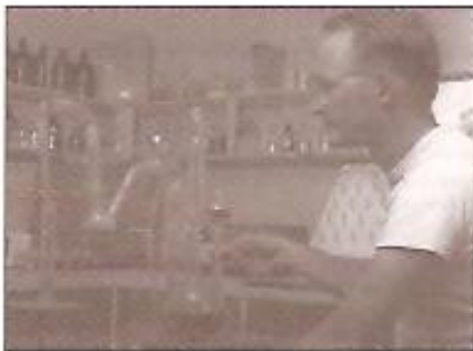
Water Use Branch Laboratory - Winnellie

Planning Section activities focused mainly on the "Top End". By 1962/63 various reconnaissance surveys had been carried out using helicopters. This method proved to be cost effective. In the final two years of this decade, activities concentrated on surface water supply investigations within major catchments, and Water Supply Development Ordinance requests.