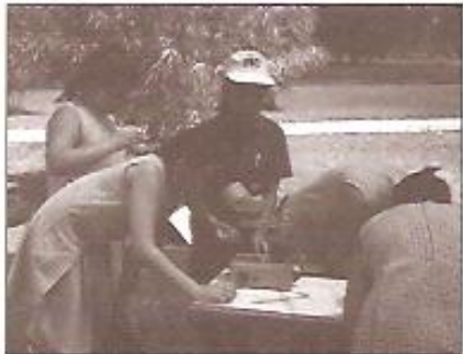
School children learning about water bugs at the Water Exploration Trail, Marlow's Lagoon, Palmerston, 1996