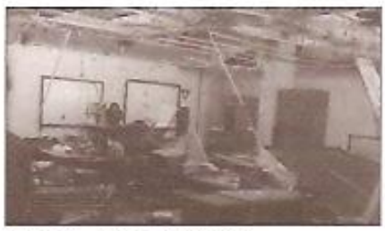
Head Office, the Vogliotti Building, Mitchell Street after Cyclone Tracy