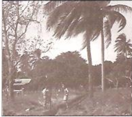
Providing a water supply to the Bathurst Island Mission