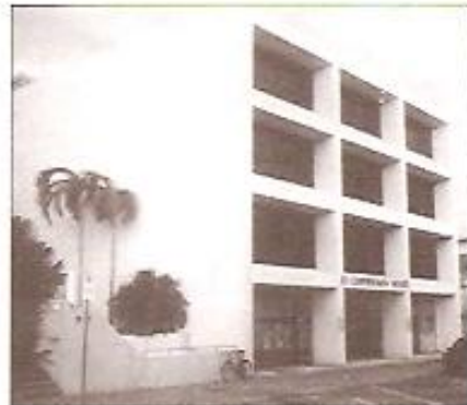
Royal Globe Building (now Carpentaria House)

The review concluded that: "there is a strong case for the creation of a single water and sewerage authority in the Territory, to take account of all phases of water resources planning and development, and related matters. This should be done as soon as possible."