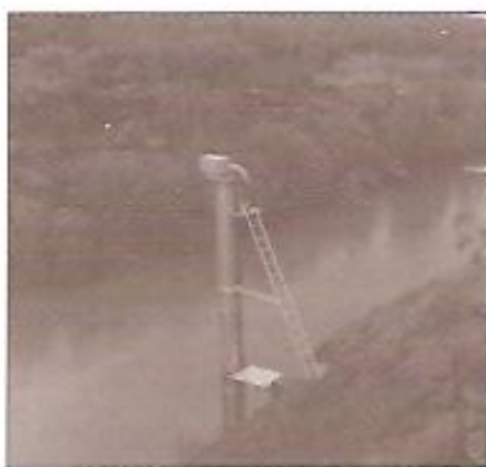
A recorder tower at South Alligator River

There wasn't a place in the Territory where we went, which we thought was inaccessible, that we didn't come across empty beer bottles. We used to get paint lids and use them as markers - nailing them high in trees so we could see them early in the Dry over the spear grass. (Col Beard)