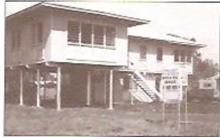
Water Use Branch, Cavenagh Street, Darwin 1955

In these early formative years, the Director's office was a residential house in Cavenagh Street, with the hydrographic staff operating out of the "Town Yard" office (now occupied by the Harbour View building) and using the CDW Workshop at 2 nd mile as a depot.