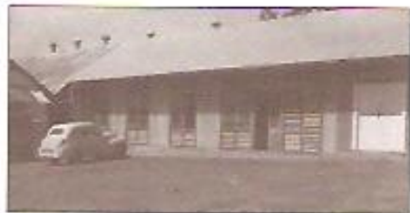
Townyard and office, Hydro Section, 1955-1967