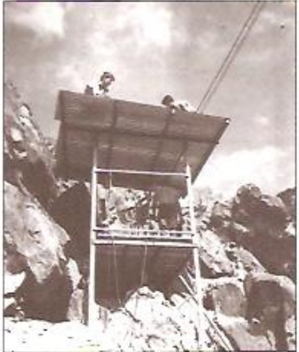
Constructing a traveller hat on Todd River

Tidal data from five sites in the Northern Territory was provided to the Royal Australian Navy Hydrographic Service in 1990. In the following year, tidal flow measurements were taken on the lower Mary River. Salinity surveys, tidal and flood gaugings, sediment sampling and aerial inspections of tidally inundated areas from Shady Camp barrage on the Mary River were completed. Telemetry systems for flood warning were established on the Victoria River and an Argos Satellite transmitter was installed on the Wickham River.