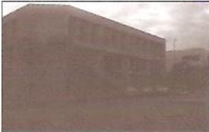
Sasco House, now Palm Court