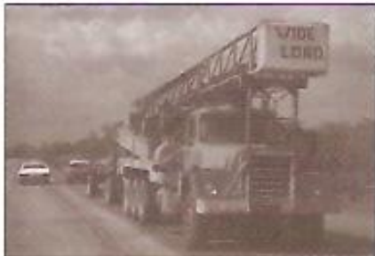
On the road, Adelaide River

Alice Springs was running out of water (G Ride)