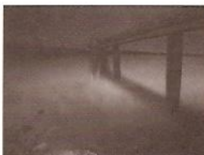
Darwin River Dam (where algae bloom was removed)