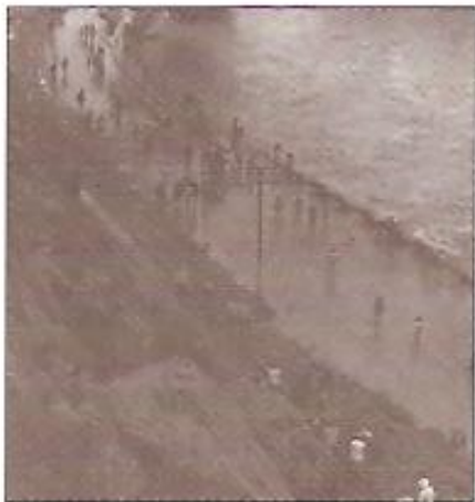
Flooding of Todd River at Heavitree Gap (1974)