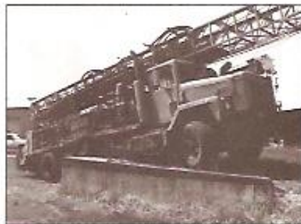
Rig crews started by camping under their trucks and hydro staff spent the entire wet season, without a break in temporary huts. (anonymous)