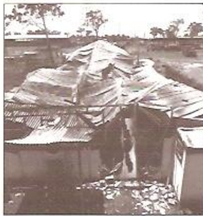
The Microbiology Laboratory, Winnellie Depot after the fire 1973

We needed an additional welder, so we purchased the parts and our bush mechanic built it. There were occasional delays in getting the equipment onto the assets register.