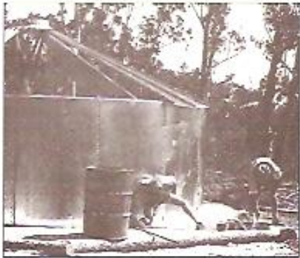
Installing a 10,000 gallon water tank at Bathurst Island