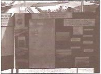
Mary River Floodplain Display