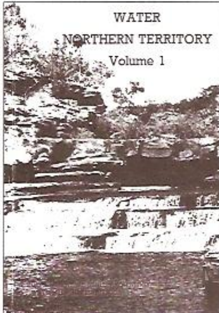
Front cover - "Water Northern Territory: Volume 1"

The Investigations Branch had been operating since 1959 under the Control of Waters Act and the Water Supplies Development Act . In 1983, the NT Government Cabinet approved the drafting of new legislation; the Water Act , for uranium reasons this was not enacted until 1992.