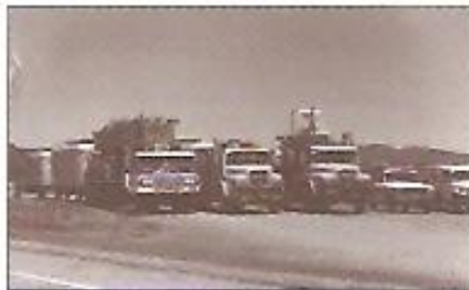
Ready for field work. (Rig, 2 MAN trucks & 2 4 X wheel drives)

No development occurs without a suitable and guaranteed water supply be that for mining, pastoral, manufacture, agriculture, aquaculture or the general population. (Rob Roos)