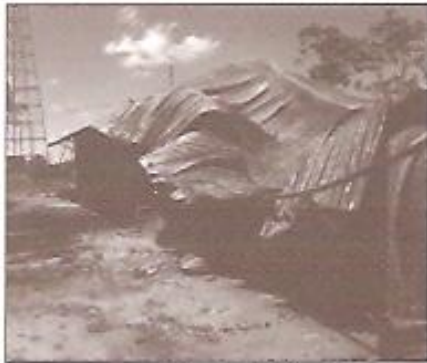
The Microbiology Laboratory, Winnellie Depot after the fire 1973

On Christmas Eve 1973, a fire destroyed the Microbiology Laboratory at the Winnellie Depot resulting in a temporary relocation to the Forestry Building at Berrimah. Staff were able to resume operations two weeks later.