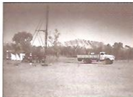
Rig 3, Mt Liebig, Haasts Bluff 1959