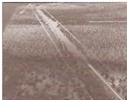
The Newcastle Waters Flood in 1974 (Stuart Highway)