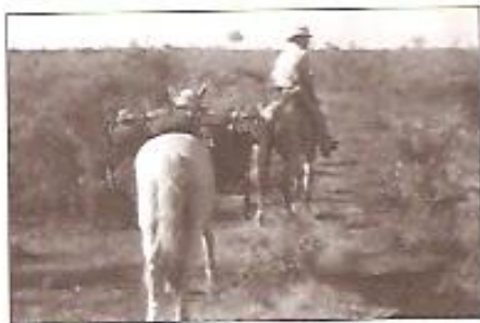
"Operation Horse Lift", Jon Lawrie

● A jet boat was used for the first time in 1962/63 for flood gauging, however the boat was underpowered and did not perform as well as a 14ft aluminium dingy with an outboard motor.