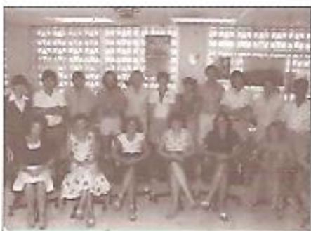
Hydrology staff in the early 1970s

The gauging station network expanded in the Gulf Area with the construction of stations on the Limmen Bight River, Looking Glass Creek (representative basin project of the AWRC), and the Clyde River which has the tallest (78 ft/24m) recorder tower built in the Northern Territory. These stations were part of the investigation related to the McArthur River Mine project. Pluviometers were installed in the Finiss River catchment, and a gauging station and three catchment pluviometers were installed for a McKinley River damsite investigation. By the end of the decade, the gauging station network had 245 instrumented stations and eighty pluviometers.