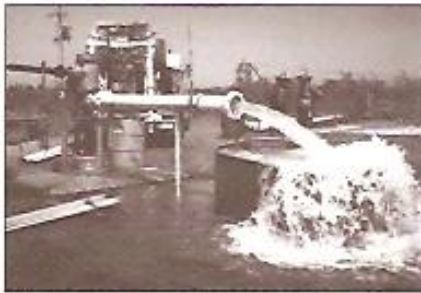
Test pumping a bore at Nabalco, Craig Hodgson.