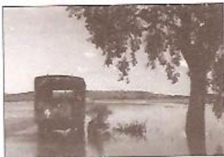
Adelaide River Plains, Beatrice Hill, late 1950's, Rink Van der Velde

From 1955/56, hydrographic activities concentrated on potential rice growing areas within the Adelaide and Mary River Basins. Five gauging stations were established within the Daly River basin during this period. Investigations relating to potential rice areas expanded further east to the floodplains of the Wildman, and the West and South Alligator Rivers. Interest in the Upper Adelaide River area intensified with the establishment of the Tortilla Flats experimental rice farm.