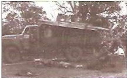
Murrakai on route to Connellans Camp, 1958

Trucks were unheard of and the loads carried by Landrovers had to be seen to be believed.