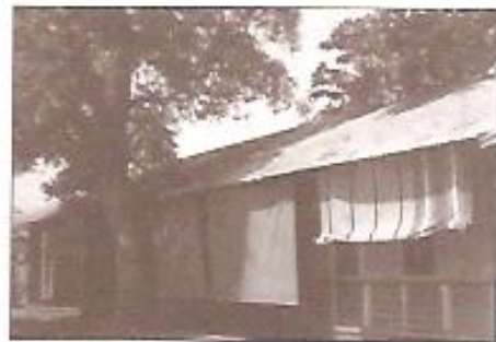
Darwin Hydro Section, Wood Street, 1963