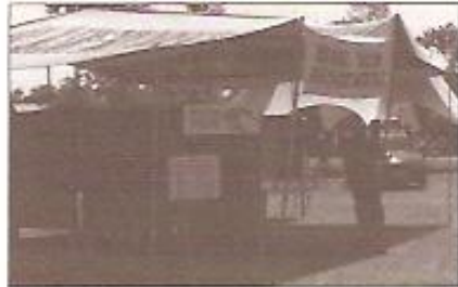
Fred's Pass Show

In May 1993, a monthly newsletter "Waterwise" detailing WRD activities was born and continues to be distributed widely. Preparation of the historical document "Water Resources - 40 years On : The History of Northern Territory Water Resources Division", commenced in 1995 to mark the 40th anniversary of WRD activities and achievements since its inception in 1955.