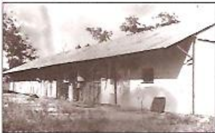
The Winnellie Depot (Showgrounds)