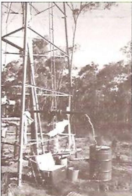
Pump testing a bore

Sixty technical projects commenced in 1984, the main two being the Wildman River Station (cashew nut plantation) and Kings Canyon Resort Groundwater Investigation for a proposed major tourist development.