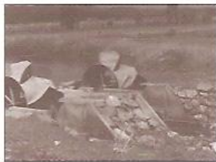
Ord River Development Scheme

To this day, our staff still live in swags in the bush, cut access tracks, winch rigs up beaches. It is a bit easier than it used to be, but we still do not have tea ladies serving us coffee and bickies. (anonymous)