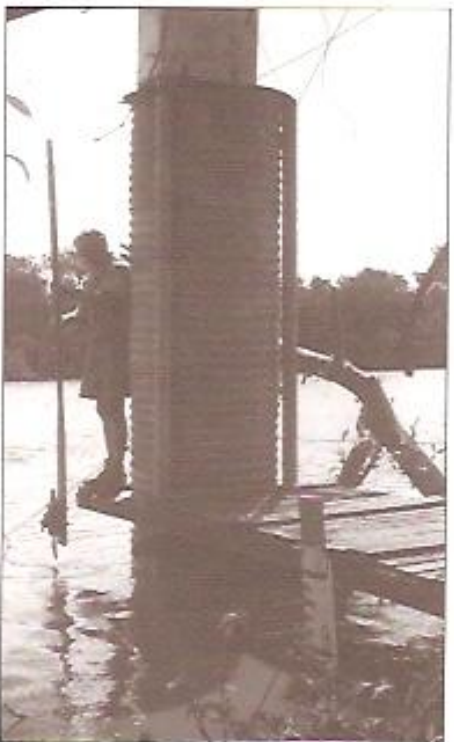
Sampling at Middle Point, Adelaide River 1955