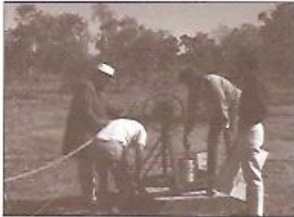
Obtaining a water sample from a local bore