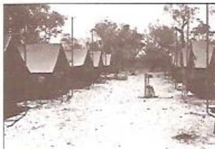
WRB's Keep River basecamp

In 1969/70, a report on the feasibility of irrigating the Keep River Plains and Weaber Plains (NT) from the Ord River was produced. As a result, in 1970 a major investigation of the Keep River area commenced. The Keep River project continued until 1974 and work included level surveys over more than 250 sq kilometres (100 sq miles) of black soil plain, the installation and monitoring of some half a dozen groundwater monitoring bores and operation of a stream gauging network on both sides of the NT/WA border. A major field camp accommodating up to thirty personnel was built along with an all weather air strip now seen on base topographic maps for the area as Kneebone Airstrip. The Air-strip is named after the Senior Technical Officer (Don Kneebone) who was in charge of the early establishment stages of this major project.