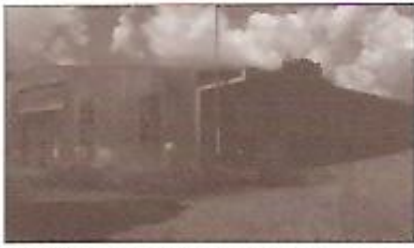
2½ Mile Depot (now moved to Tannadice Street)