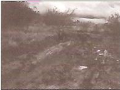
We were bogged in this! Warren Archard