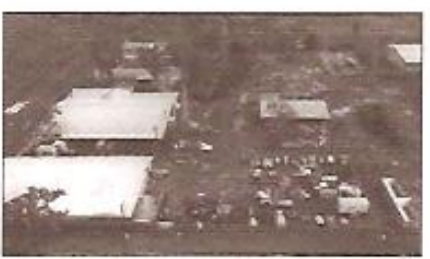
Water Resources Depot, Winnellie Showgrounds before "Tracy"