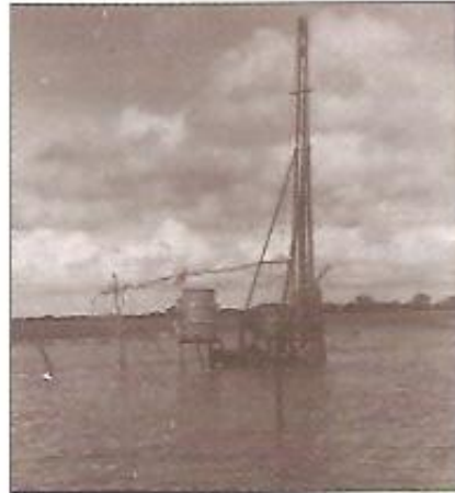
Humpty Doo - flooded drilling cable tool rig - February 1956

An evaporation study, using cetyl alcohol, commenced on Manton Dam during the early 1960's. Other major field activities included an investigation for a proposed irrigation project on Elsey Station. Also investigation for augmentation of Darwin's water supply was carried out that involved survey work for contouring of the catchment area, reservoir and a potential dam site on the Darwin River were completed.