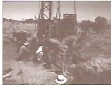
Papunya No.3

To assist community development, investigation and production bores were drilled at Papunya, Warrabri, Mt Barkly, Areyonga, Hermannsburg, Santa Teresa Mission, Pine Valley and the Dulcie/Sandown area.