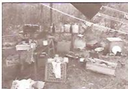
Field setup for water analysis at Middle Point during Adelaide River salinity tests

During this decade the Branch operated three laboratories: East Point for chemical analysis; Alice Springs and Winnellie conducted bacteriological analysis only, while Water Quality Section in Darwin did all the sampling Territory wide for bacteriological and chemical analysis.