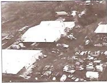
Depot, Winnellie Showgrounds