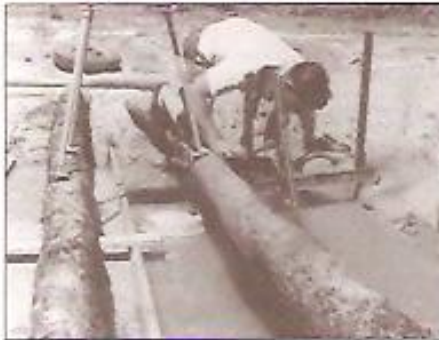
Flow testing at McMinns Lagoon - Bore 31