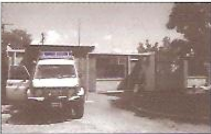
2 1/2 Mile Lab