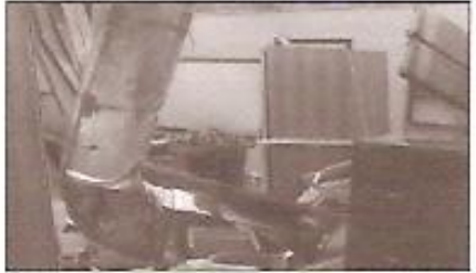
Head Office, the Vogliotti Building, Mitchell Street after Cyclone Tracy