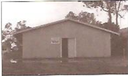
Water Use Branch, Car Cavenagh, McLachlan & Woods Streets 1959