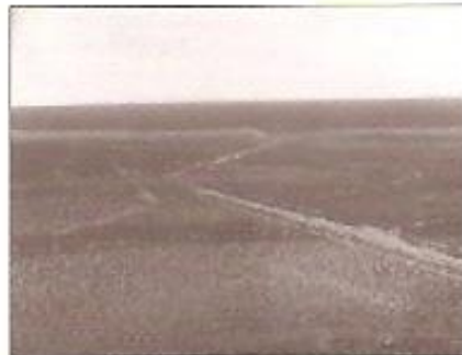
The Newcastle Waters flood in 1974

Pluviometers were installed and flow measurements taken during 1972 for the Tipperary sorghum enterprise. A gauging station was established on the Magela Plains outflow and stations were installed for what was to eventually become the Uranium Province investigation. In 1973, further gauging stations and pluviometers were erected in the Darwin River Dam catchment and for the Scott Creek agricultural development, west of Katherine (with Agriculture Branch assistance).