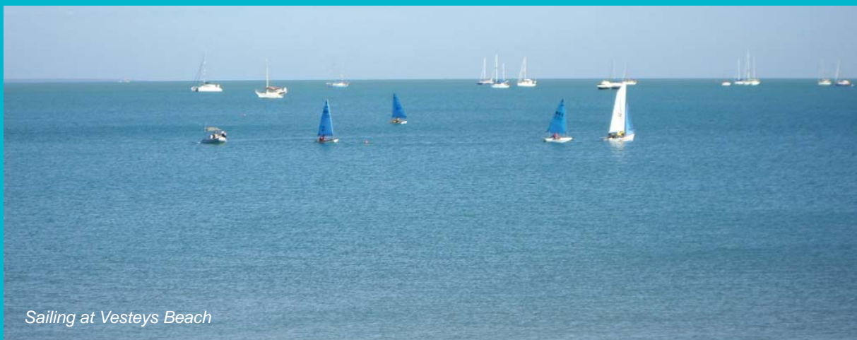
Sailing at Vestey's Beach