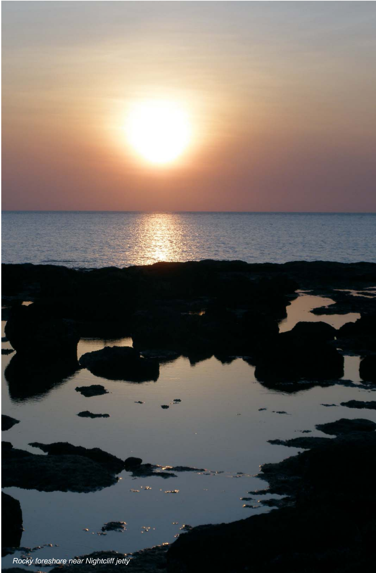
Rocky foreshore near Nightcliff jetty